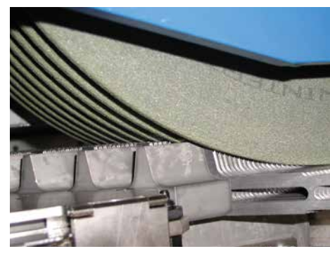
Grinding of hedge trimmers